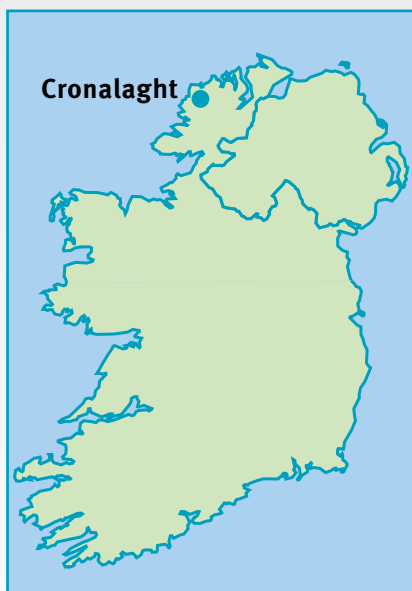
FIG 1. LOCATION

There have been wind power projects in Ireland involving single machines for many years, but it was not until 1981 that significant operating experience under Irish conditions became available when the then Department of Energy established 13 projects around the country in a coordinated demonstration programme. Since then, many more projects have been commissioned, supported by government and European Union funds.